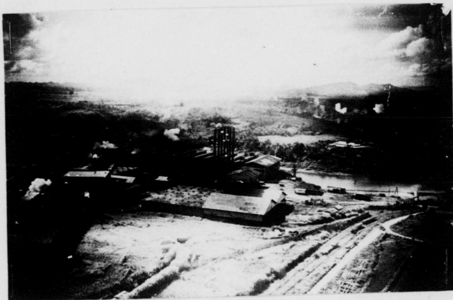
Fabrica Power Plant Fabrica, Negros Island, P.I.